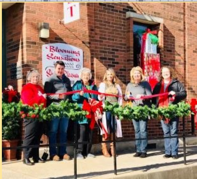
Another business relocation in downtown Beattyville!!

Want to Capitalize on Social Media with *your* business this Holiday Season?