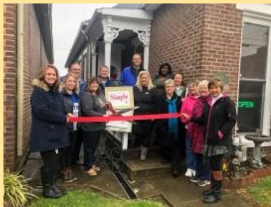
Cynthiana also has a shop relocate downtown! Simply Vintage