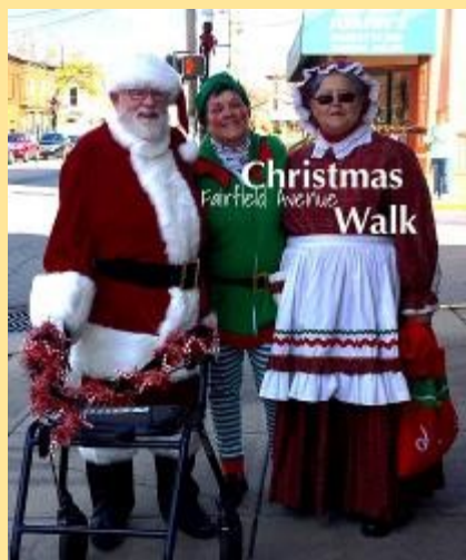
Shop Small with Santa on the Avenue in Bellevue!